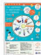
CD-ROM for students