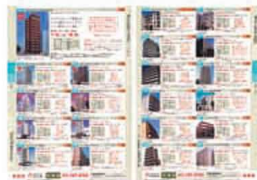
The Apartment Yearbook For Students

The Yearbook has a circulation of more than 18 million copies! These copies are available at career consulting offices in high schools and student affair's section in universities. They are also distributed at university entrance examination sites around the country—so that students can easily pick one up. This circulation figure is comparable to that of commercial rental housing magazines and our Yearbooks play a large role in our tenant advertising.