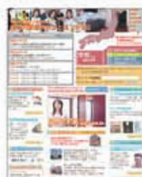
Website via cell-phone