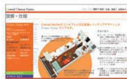
Room retrieval site

To match the full-scale penetration of the IT generation, we provide timely information in various forms, such as through the Internet and mobile phone websites, as well as FAX, e-mail, and postcards.